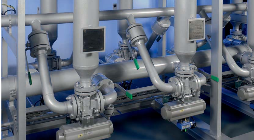
Detail of a Modular Filter Unit Type RSFA 27

For more information on FAUDI RSFA filter systems or any other FAUDI filtration product, please contact our representatives or visit our website at www.faudi.com .